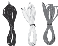
Voltage Input Sensor