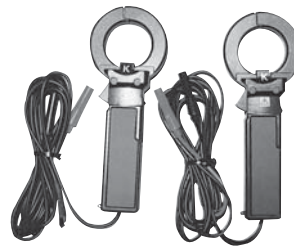
Current Sensor CT-40(600A max)