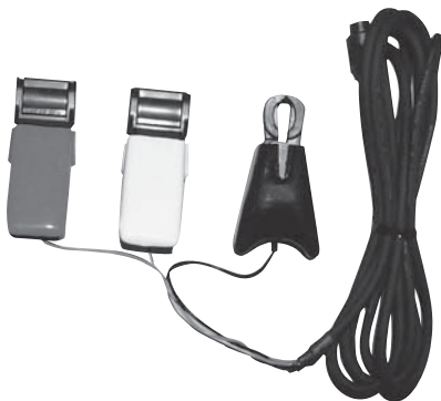
Model PS-60 Non-contact Type Voltage Sensor