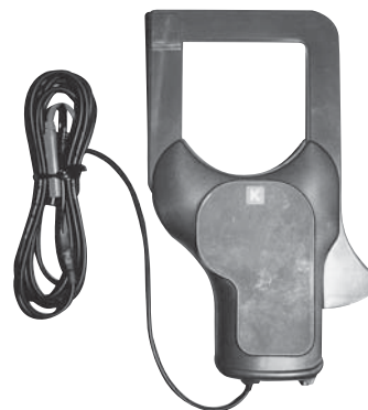
Model CT-80 Big Window Current Sensor 80 φ mm 1000A max