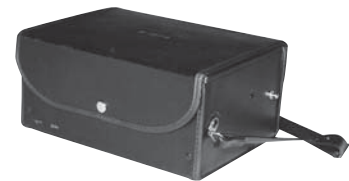
Hard Carrying Case